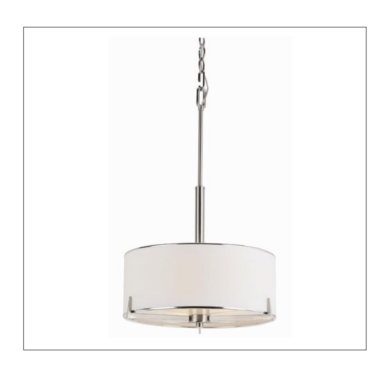
Warranty 12 months from shipment