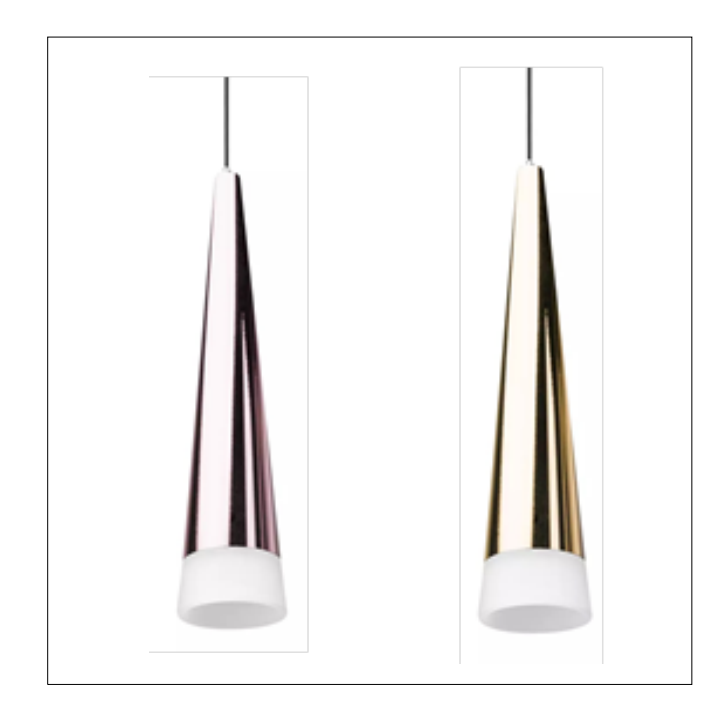
Warranty 36 Months from shipment