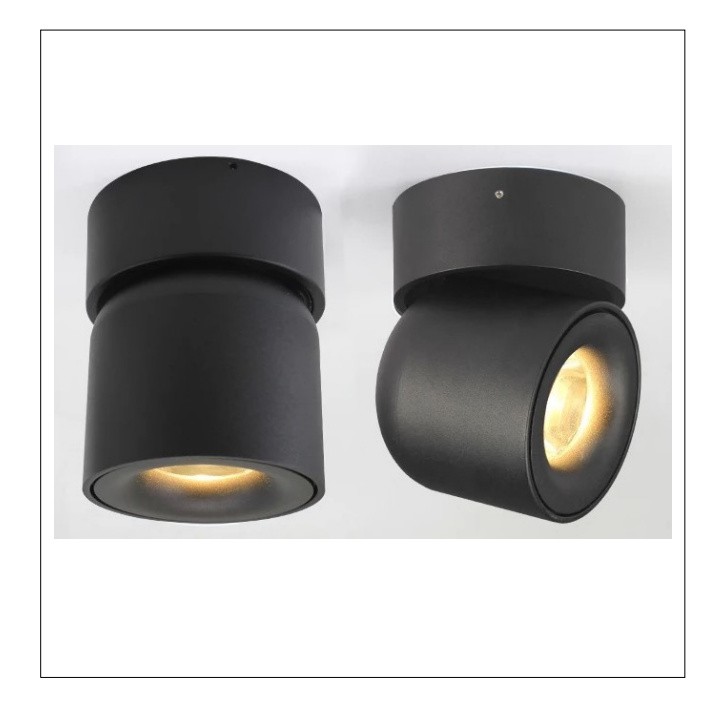
Warranty 36 Months from shipment

4 (Dia) X 8 (H) – 18 Watt Fixture 6 (Dia) X 10 (H) – 22 Watt Fixture