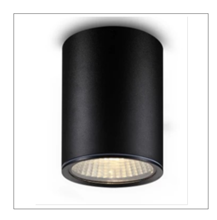
Warranty 36 Months from shipment