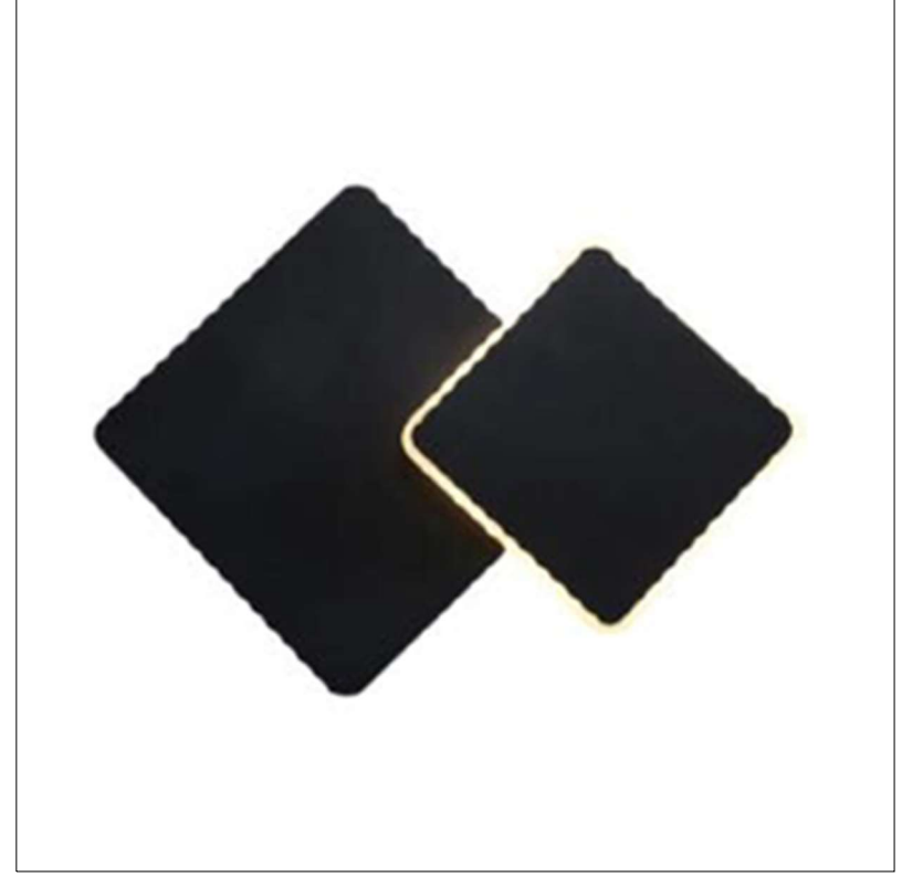
Warranty 36 Months from Shipment

Dimensions (inch): 20 (L) X 14 (H) X 4.5 (D)