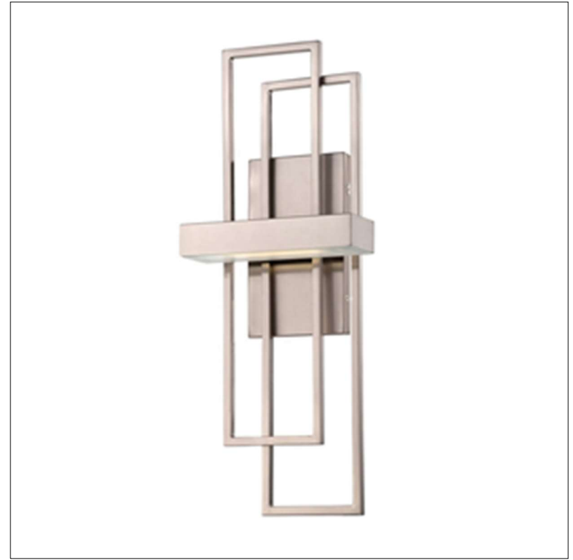
Warranty 36 Months from Shipment

Dimensions (inch): 18 (H) X 10 (W) X 3 (D)