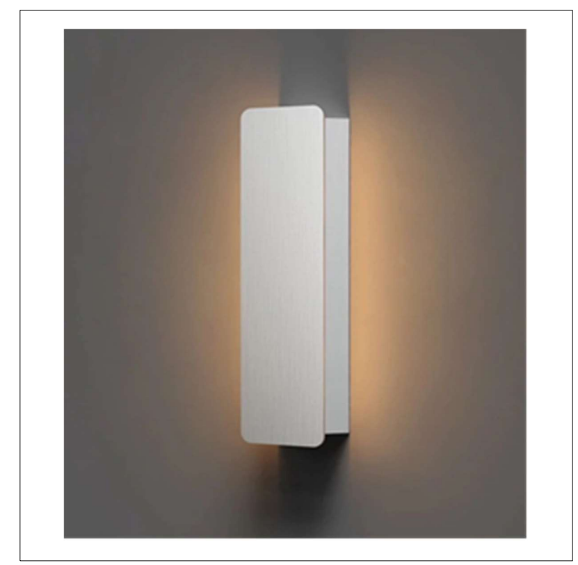
Warranty 36 Months from Shipment

Dimensions (inch): 12 (L) X 6 (H) X 4.5 (E)