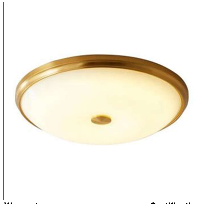
Warranty 36 Months from Shipment