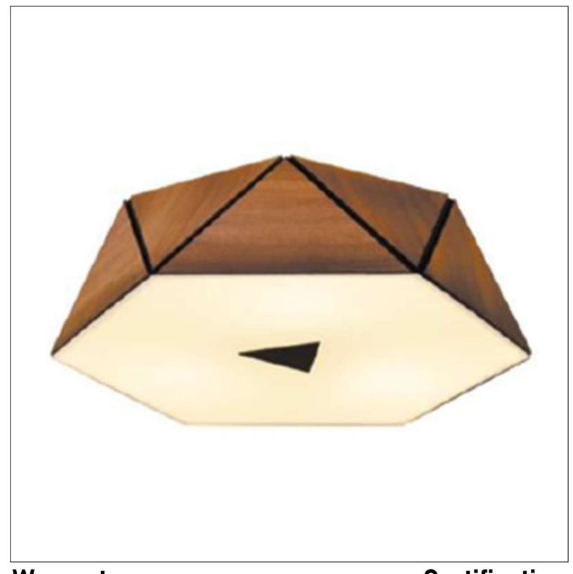
Warranty 36 Months from Shipment