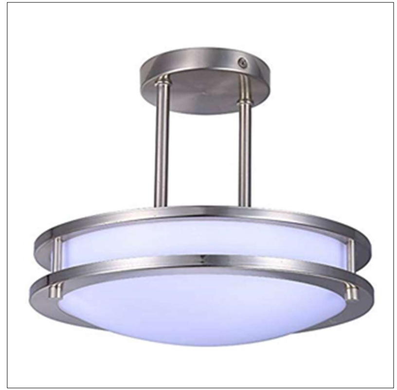
Warranty 36 Months from Shipment