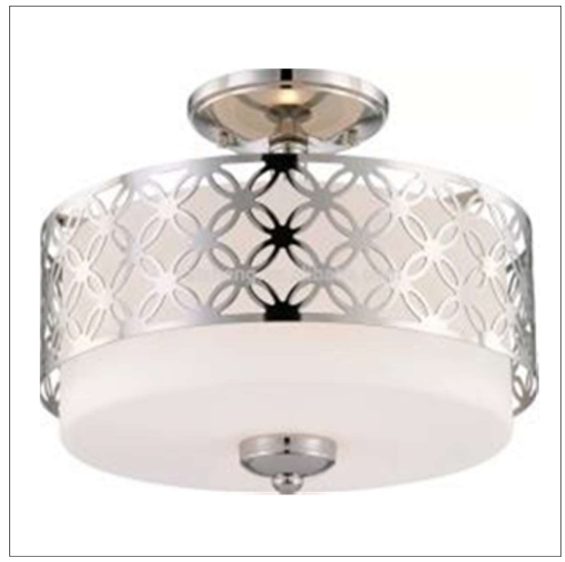
Warranty 36 Months from Shipment