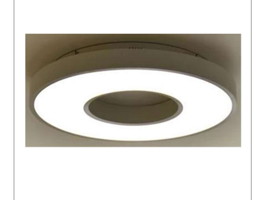
Warranty 36 Months from Shipment