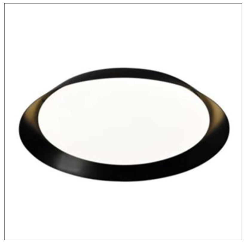
Warranty 36 Months from Shipment