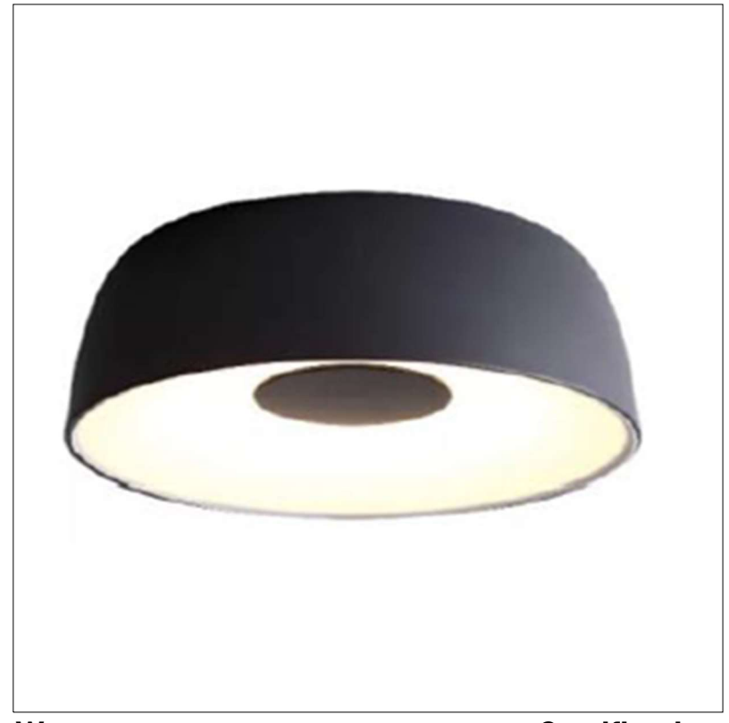
Warranty 36 Months from Shipment