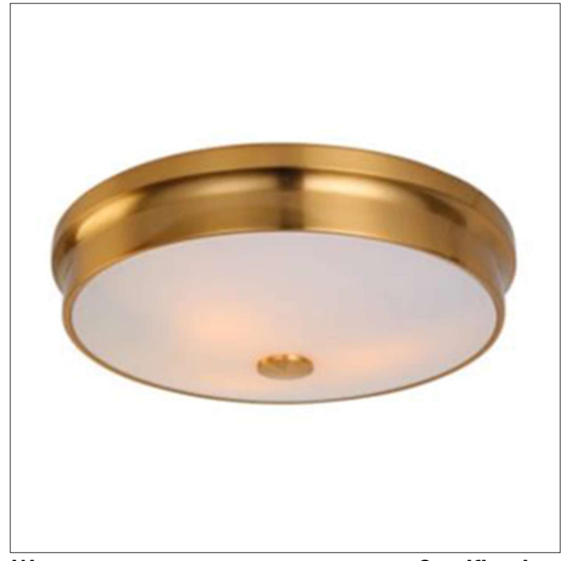
Warranty 36 Months from Shipment