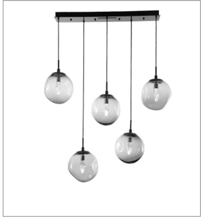
Warranty 36 Months from Shipment

Dimensions (inch): 40 (W) X 14 (D) Overall Height: 10FT (Adjustable)