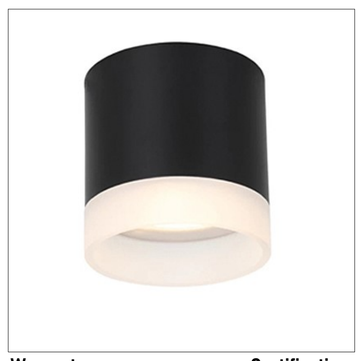
Warranty 36 Months from Shipment