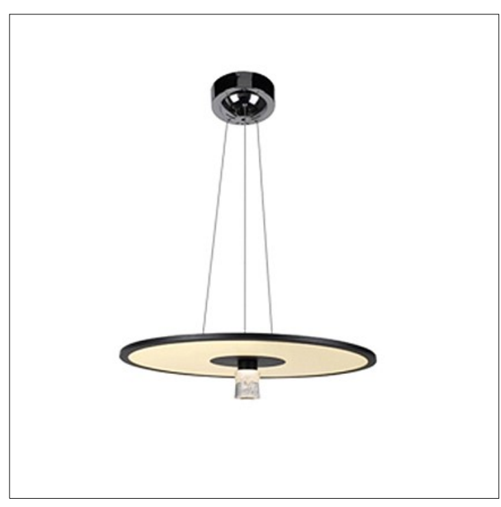
Warranty 36 Months from Shipment