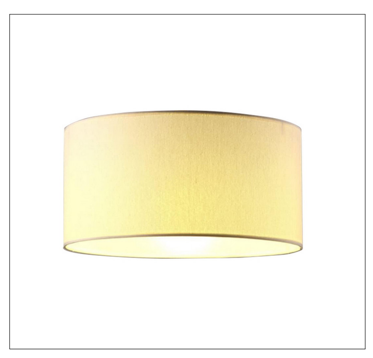
Warranty 12 months from shipment

Dimensions (inch): 10 (Dia) X 8 (H) **Custom dimension available